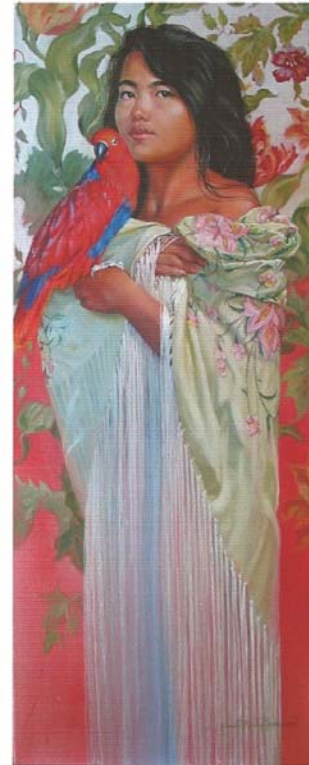
"To Tell A Story" oil 16 x 40" Award of Merit CFA's Members Show & People's Choice Award

Anyone interested in the arts should consider heading down for this event. ~