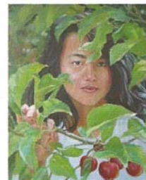
"Nanawaka & the Apple Tree" oil 16 x 20"