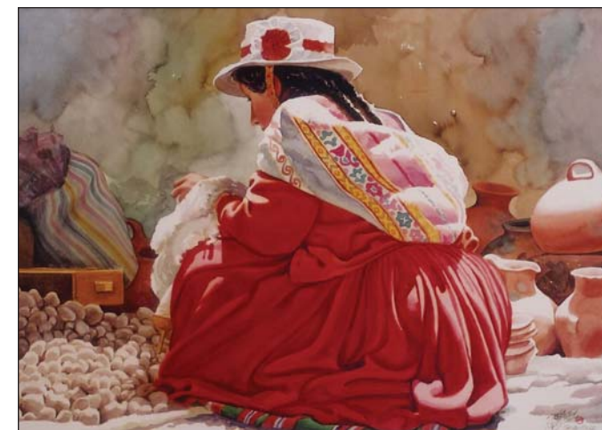
Chivay