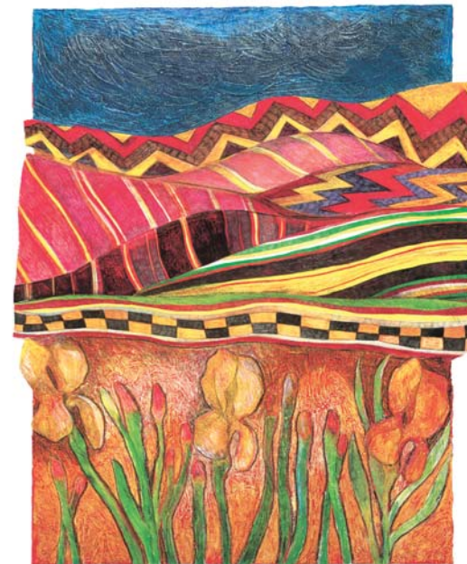
Earthscape by Patricia Wyatt, 2007 Poster

“Indio is known as the Coachella Valley’s ‘City of Festivals’”